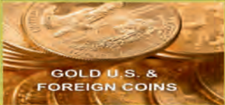
GOLD U.S. & FOREIGN COINS